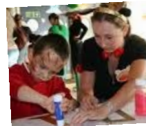
Face Painting is fun!

P.A.L.S. kids will have opportunities to participate in activities such as kickball/soccer clinics, swimming, bowling, etc. Children will also have regular opportunities to socialize with age-appropriate peers and volunteer peer-pals during events like arts & crafts, dances, game night, movie night, and other fun occasions.