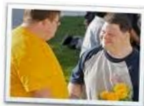
Making New Friends!

P.A.L.S. adults, age 17 and older, will have separate opportunities to participate in similar activities. As our program expands we are hoping to offer opportunities for adults to participate in daytime trips to cultural & sporting events and regional points of interest.